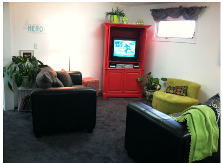
Lee's Room provides a comfortable environment for child forensic interviewers to conduct investigations with abused children.