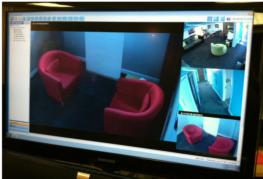
exacqVision Professional client software allows child forensic interviewers to easily search and review the video for additional clues and evidence.

Four Axis 1.2 megapixel IP cameras were installed to cover the lobby, hallway and two interview rooms. With the expanded coverage, police officers can spearhead situations of angry parents entering the facility or other activity outside the interview rooms. Now, they are capable of tracking intruders before a problematic situation occurs by viewing each camera simultaneously on the exacqVision Professional client software. The exacqVision solution ensures the