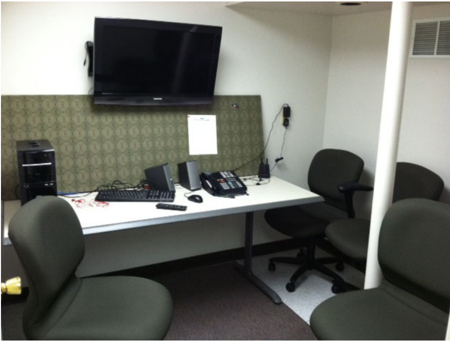
Child forensic interviewers and police officers review video with exacqVision Professional client software in the team room.